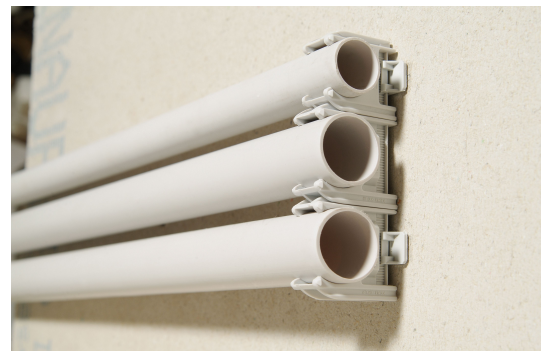
The perfect combination: ESD Euro-fastening anchor and EC Euro-clip for efficient pipe fixing.

Schnabl Stecktechnik GmbH Bahnhofplatz 1, Postfach 63, 3100 St. Pölten, Austria Telefon +43(0)2742/22167-0, Telefax +43(0)2742/22167-50 office@schnabl.works, www.schnabl.works