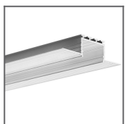
KOZUS Extrusion Ref: B7823NA